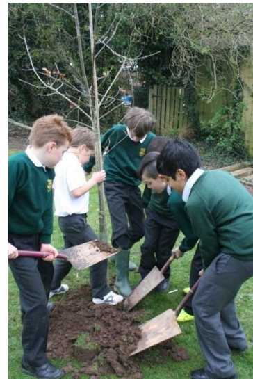
University hospital, Coventry