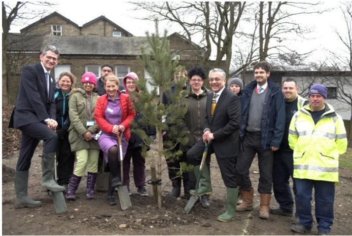
Bradford Royal Infirmary