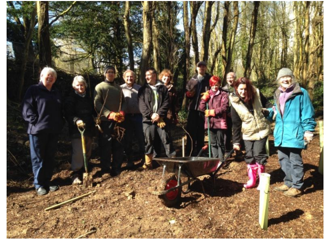
South Warwickshire, staff involved in planting