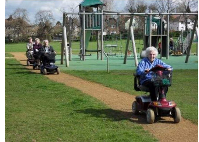
Marston Green Health Route Map - Length 2.5 miles approx

The Centre for Sustainable Healthcare has developed the Marston Green Health Route to take in the various nature reserves, schools, church and coffee shops of the Marston area.