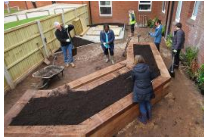
Nottinghamshire Health Care NHS FT