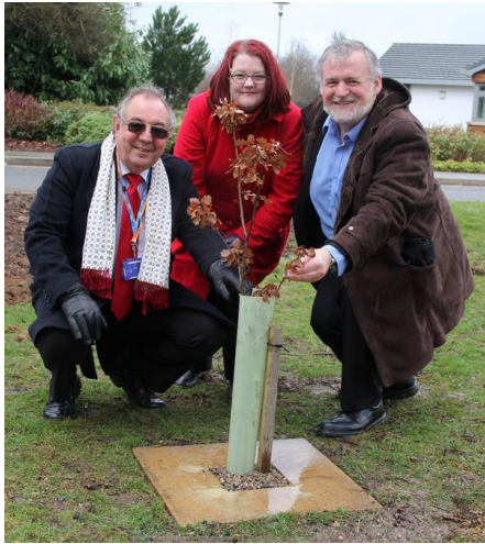
Derbyshire Healthcare- 26 trees- paperless